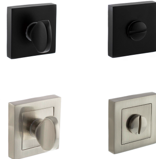
Product Finish Pictured: Matt Black & Satin Nickel