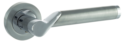
Product Finish Pictured: Satin Chrome/Polished Chrome